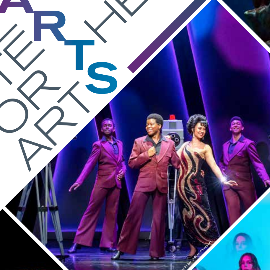
UK Cast of Ain't Too Proud.