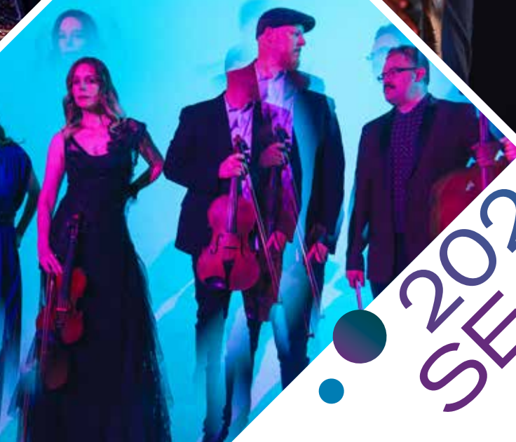
Step Atrial Vitamin String Quartet