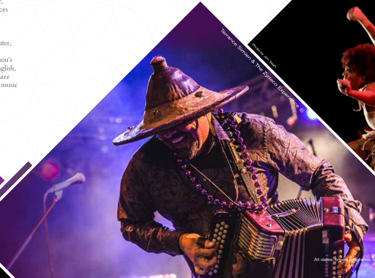
Terrance Simien & The Zydeco Experience

For over 40+ years, two-time Grammy® Award winning, 8th generation Louisiana Creole, Terrance Simien has been performing traditional Zydeco roots music. Join us for a celebration of the up-tempo sounds and syncopated rhythms of zydeco – blending blues, R&B, indigenous, soul, Afro-Caribbean, Cajun, and early Creole music. Simien and his band mates have performed nearly 10,000 concerts, touring millions of miles to over 45 countries. They've played with legends including Art Neville, Los Lobos, the late Robert Palmer, and Dave Matthews Band to name a few. Don't miss this rockin' evening of washboard, accordion, brass, and guitar performed by Zydeco masters!