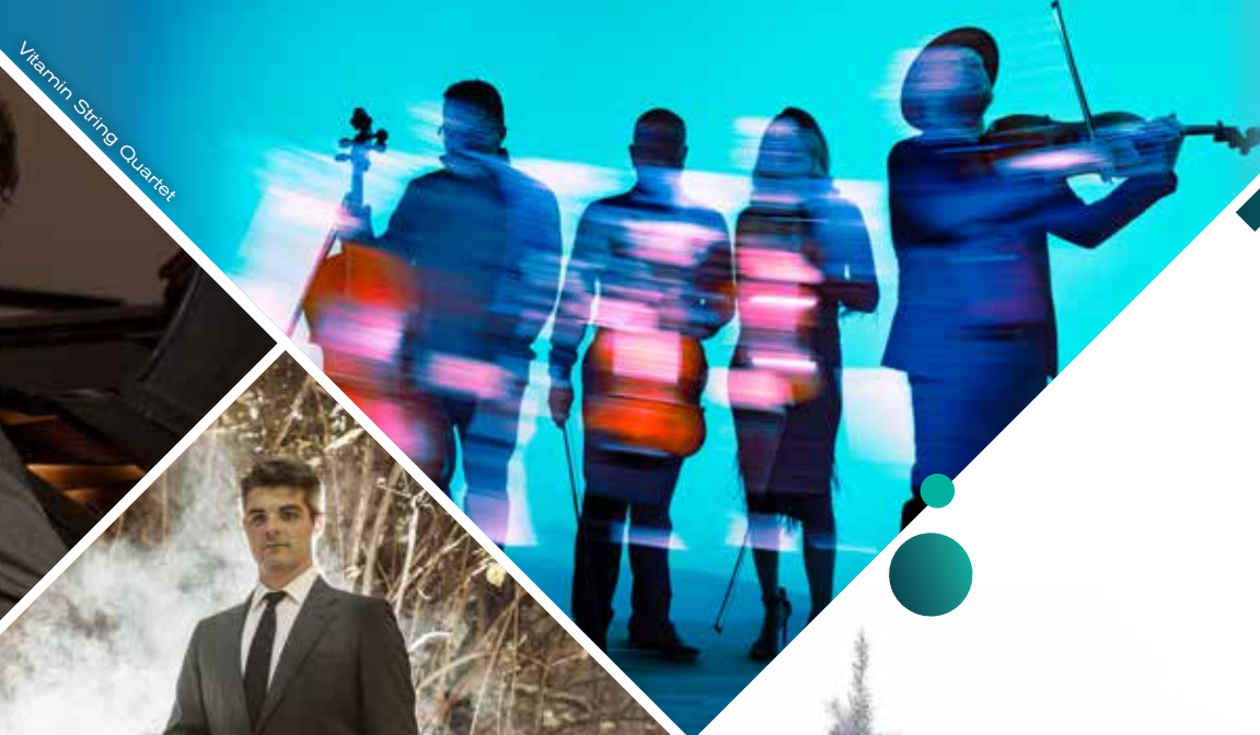
Vitamin String Quartet