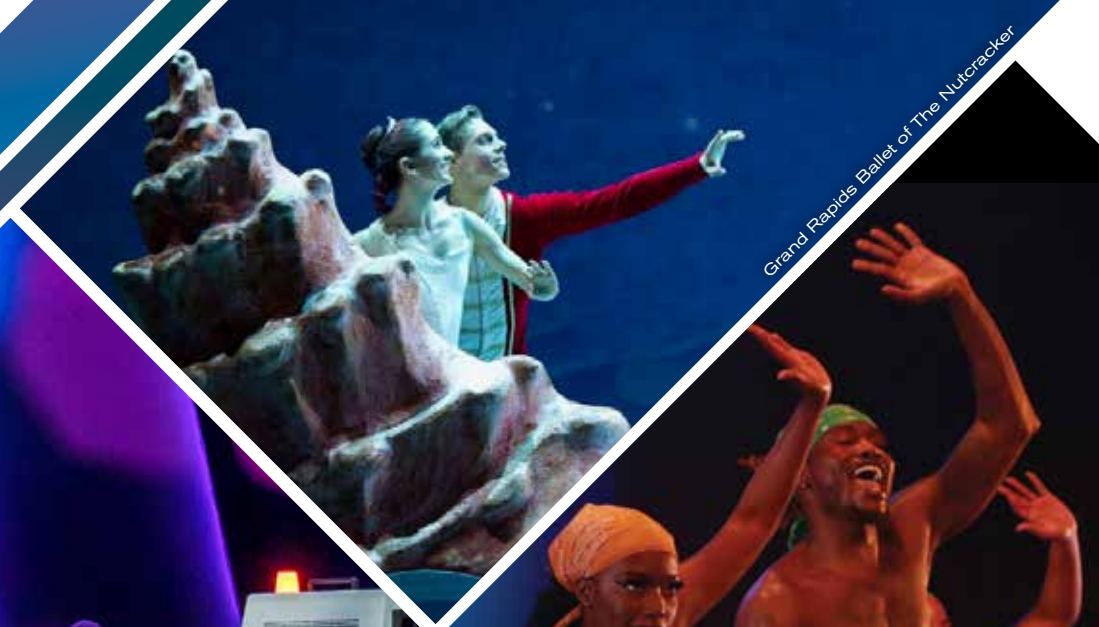
Grand Rapids Ballet of The Nutcracker