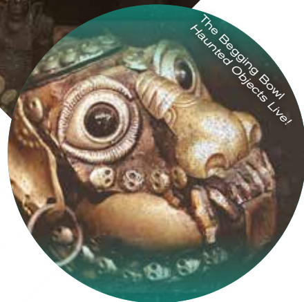
The Begging Bowl Haunted Objects Live!