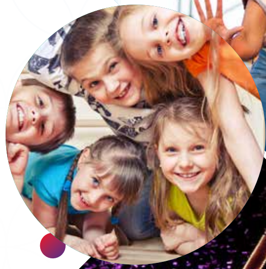
Rising Stars