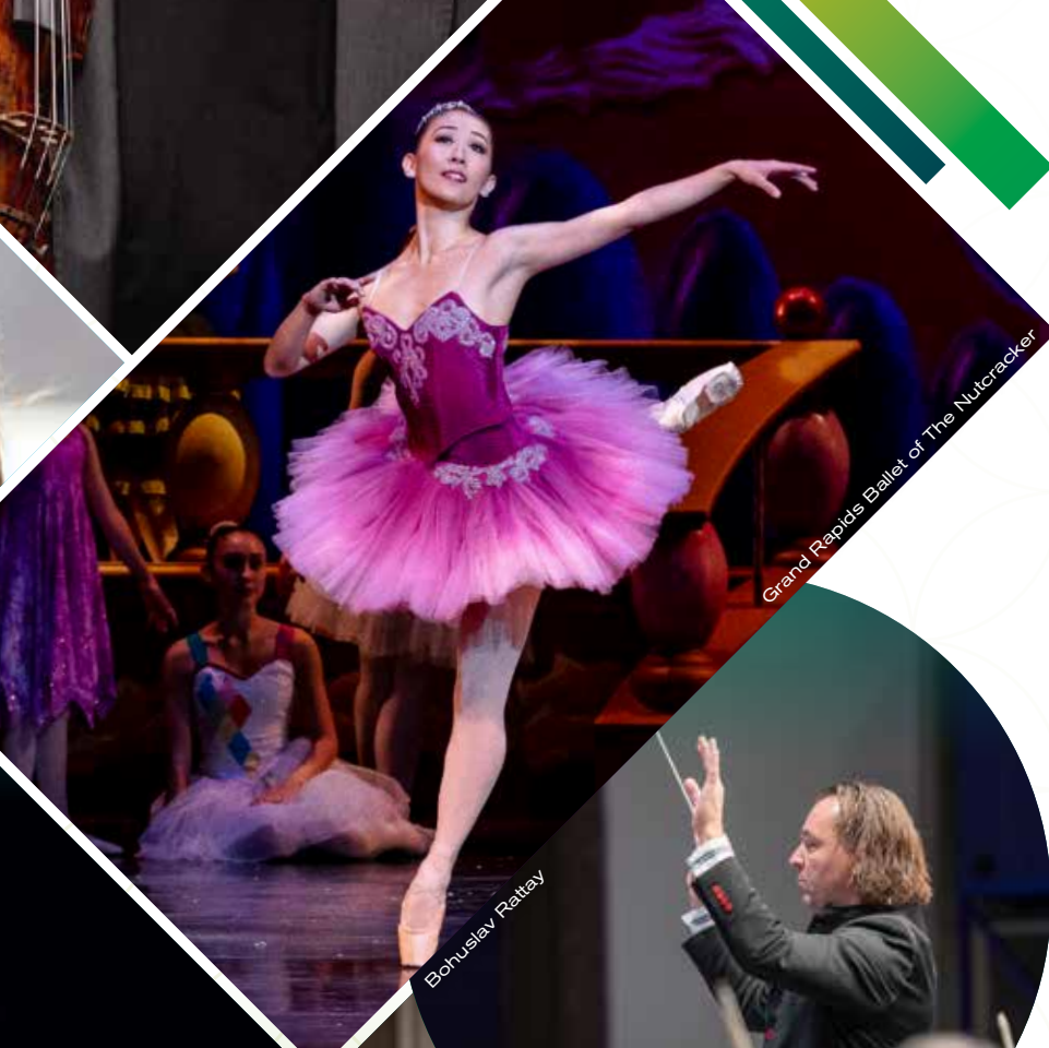
Grand Rapids Ballet of The Nutcracker