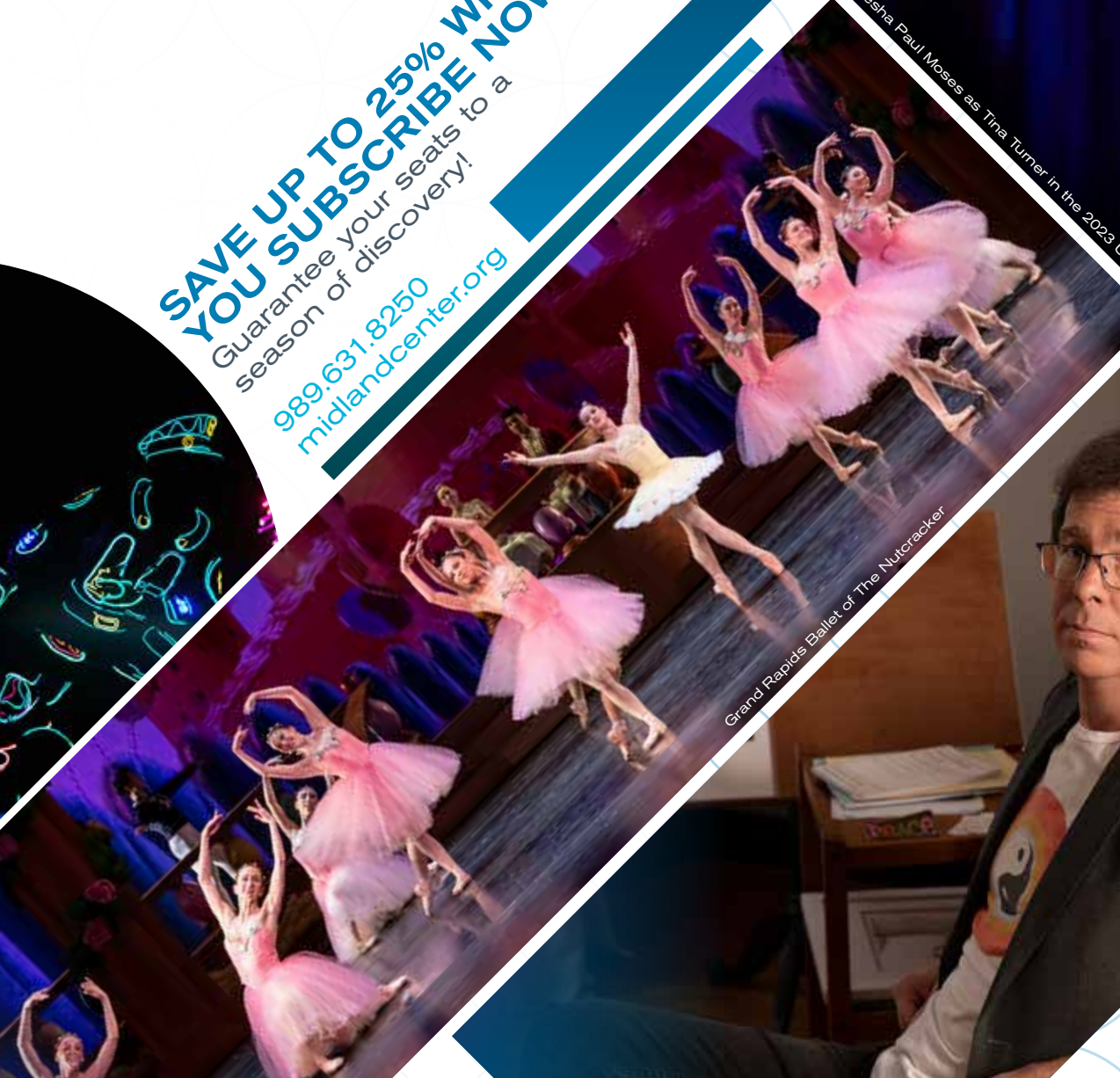
Grand Rapids Ballet of The Nutcracker

SAVE UP TO 25% WHEN YOU SUBSCRIBE NOW! Guarantee your seats to a season of discovery! 989.631.8250 midlandcenter.org