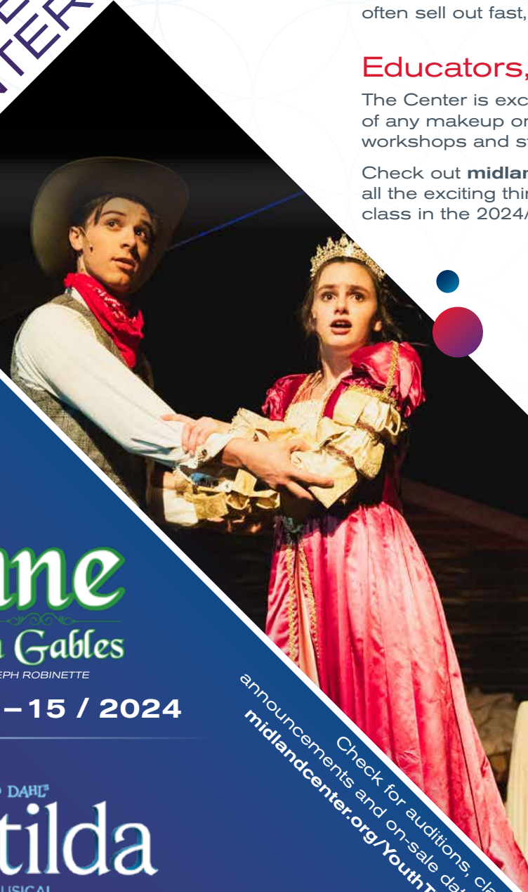
Sleepy Hollow