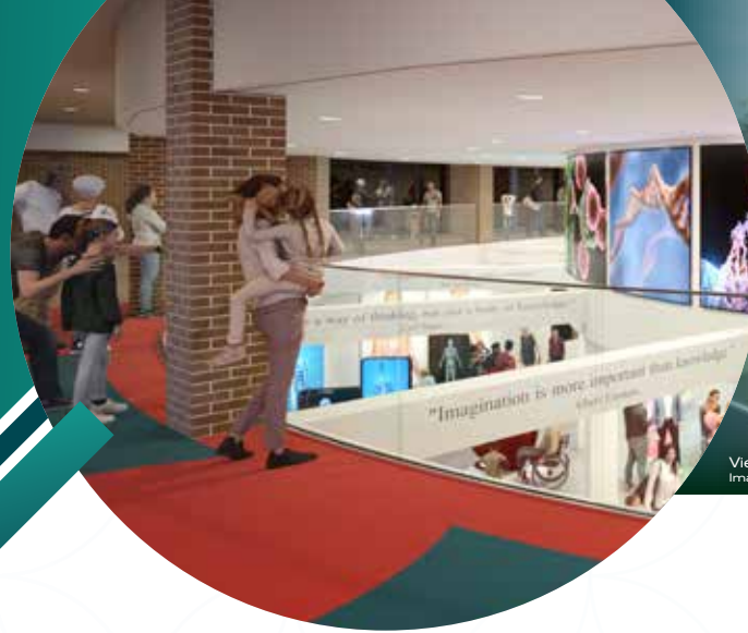
View of renovated education wing as seen from West St. Andrews Rd. Images are conceptual and subject to change.

Please visit midlandcenter.org/benefits to learn more.