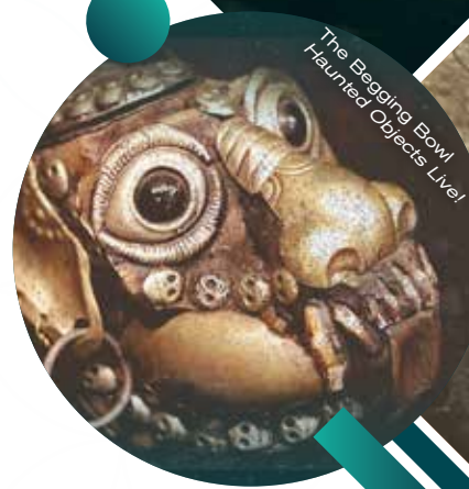
The Begging Bowl Haunted Objects Live!