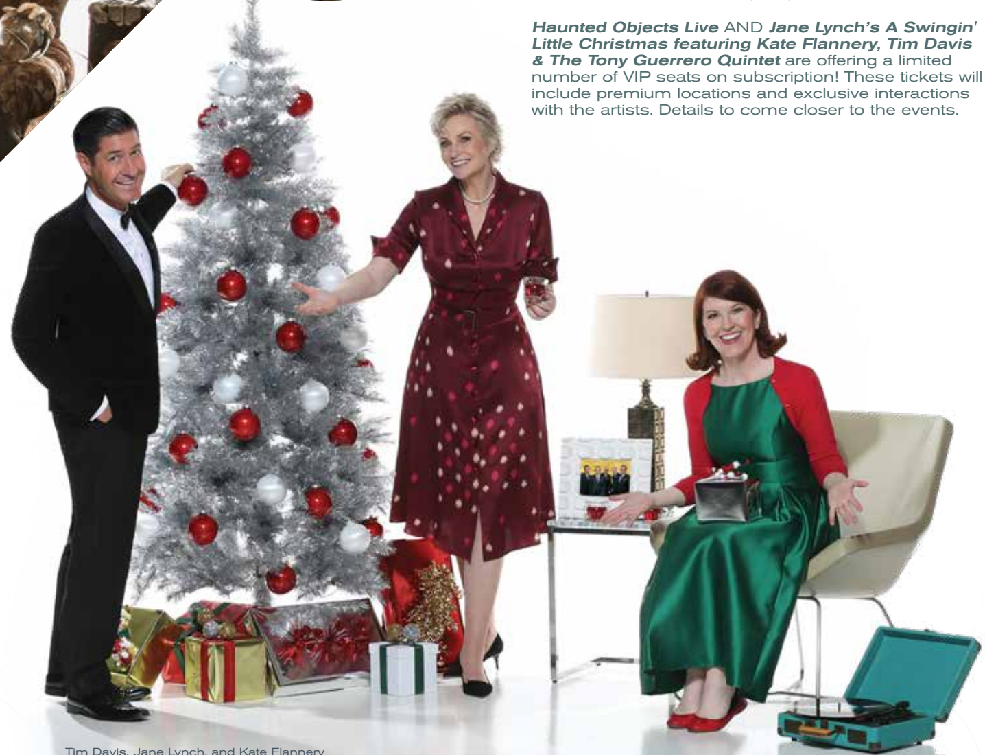
Tim Davis, Jane Lynch, and Kate Flannery