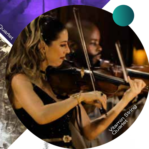
Vitamin String Quartet