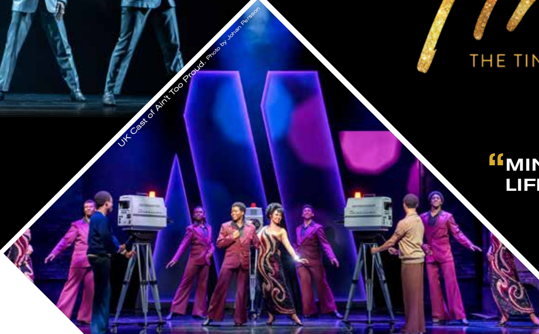
UK Cast of Ain't Too Proud.