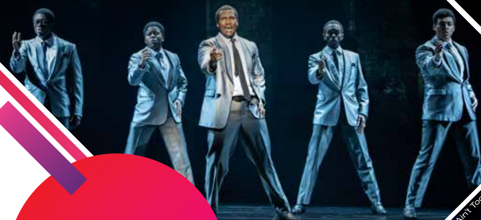
UK Cast of Ain't Too Proud.

"An ELECTRIFYING THRILL-A-MINUTE NEW MUSICAL" The Washington Post