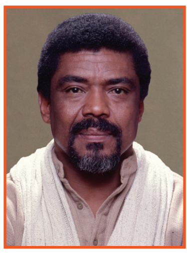
ALVIN AILEY FOUNDER