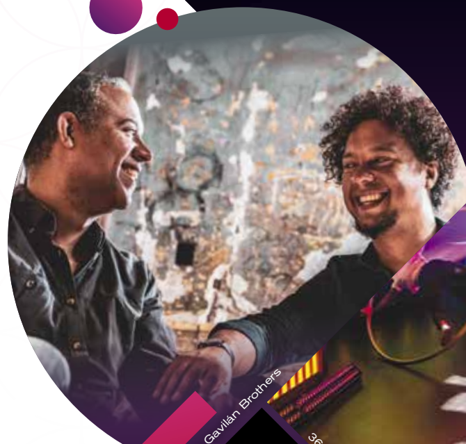
The Gavilan Brothers