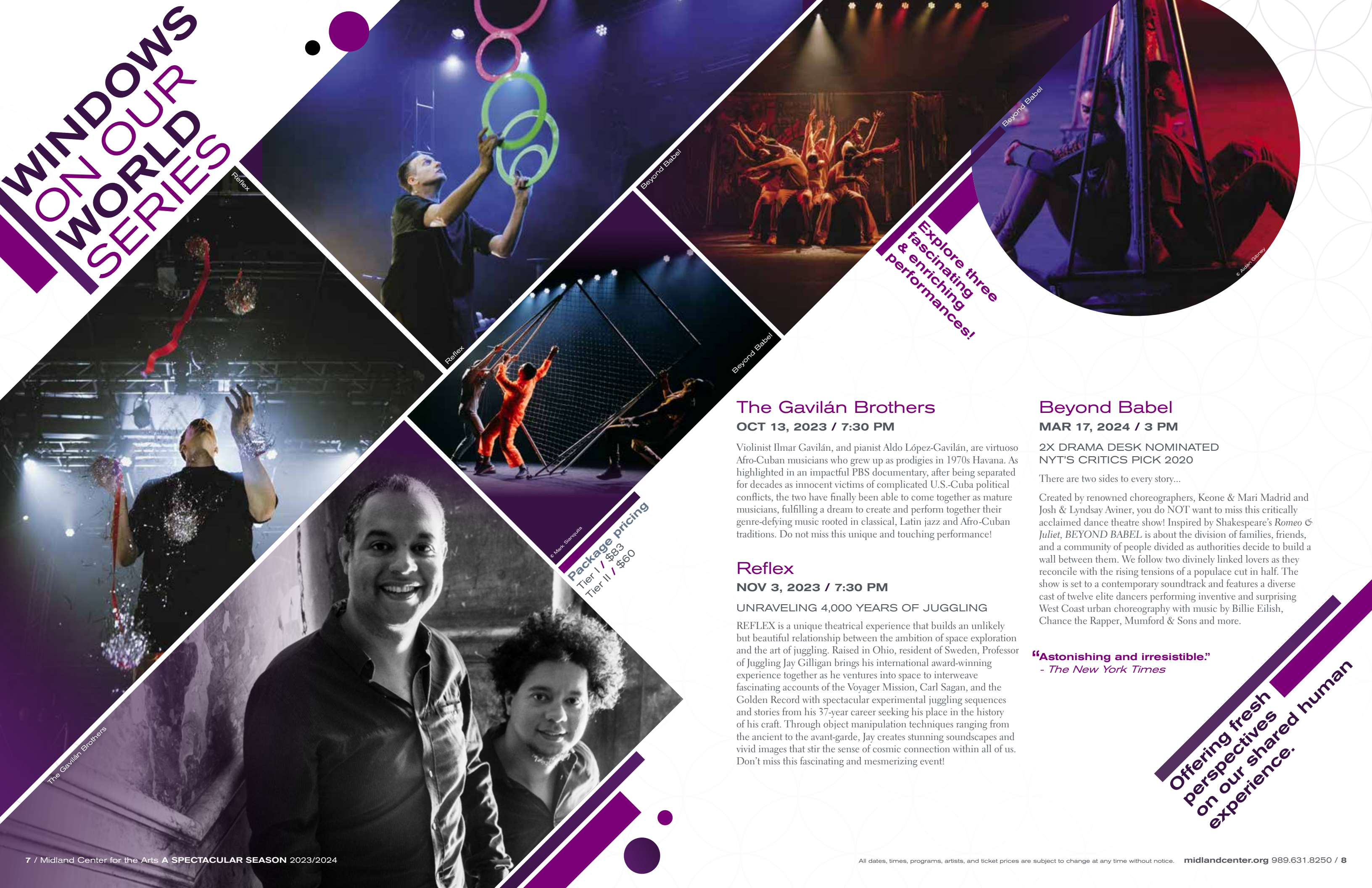
The Gavilán Brothers