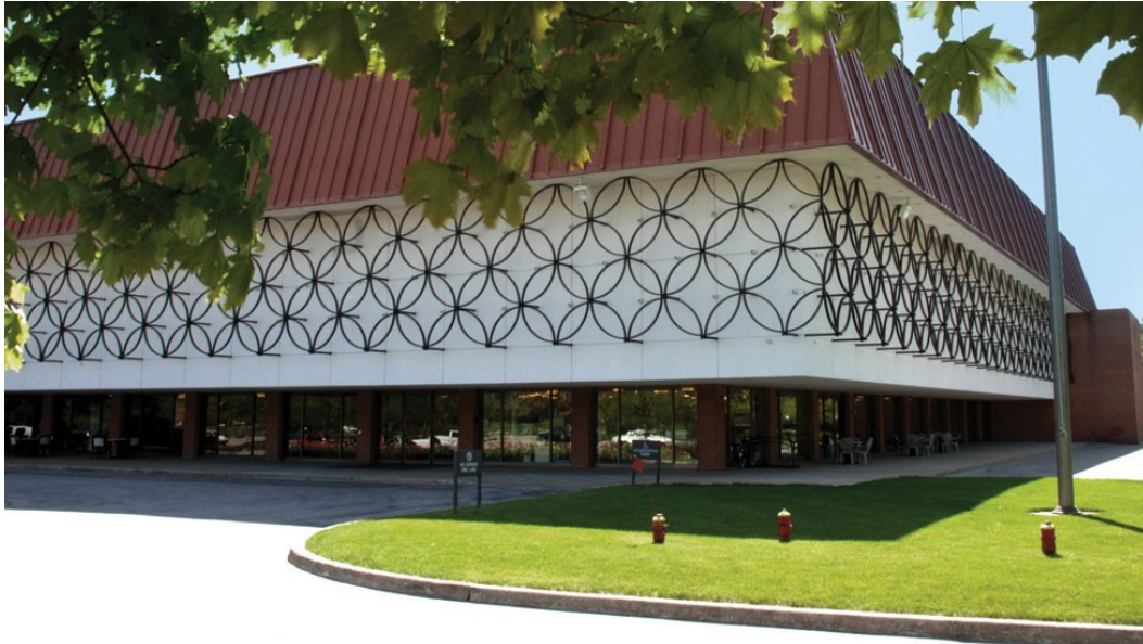
Midland Center for the Arts

My class is going to watch a show called Kate the Chemist at the Midland Center for the Arts.