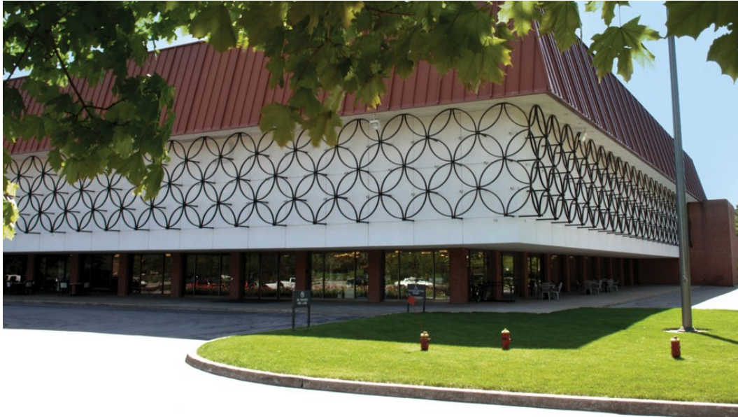
Midland Center for the Arts

My class is going to watch a show called Jabari Dreams of Freedom at the Midland Center for the Arts.